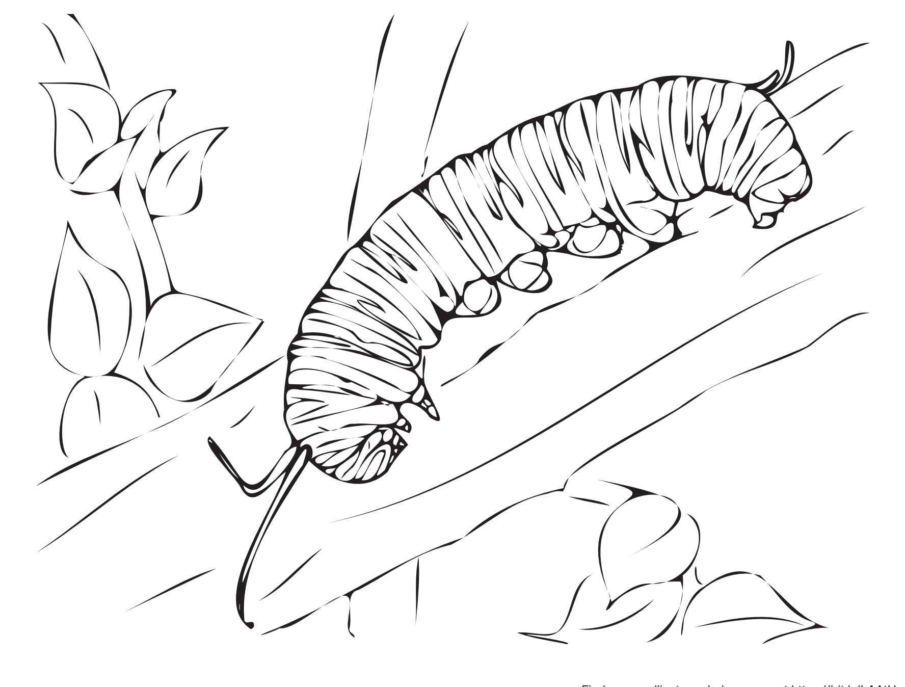
Find more pollinator coloring pages at https://bit.ly/LAAtHome