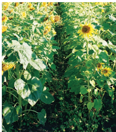
Sulfentrazone PRE (4.5 oz/A)