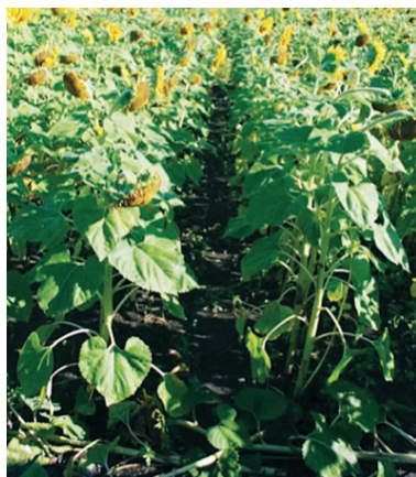
Beyond Herbicide (4 oz/A) + NIS (0.25% v/v) + AMS (17 lb/100 gal)

BASF Field Trial (2010). NDSU, Fargo, ND.