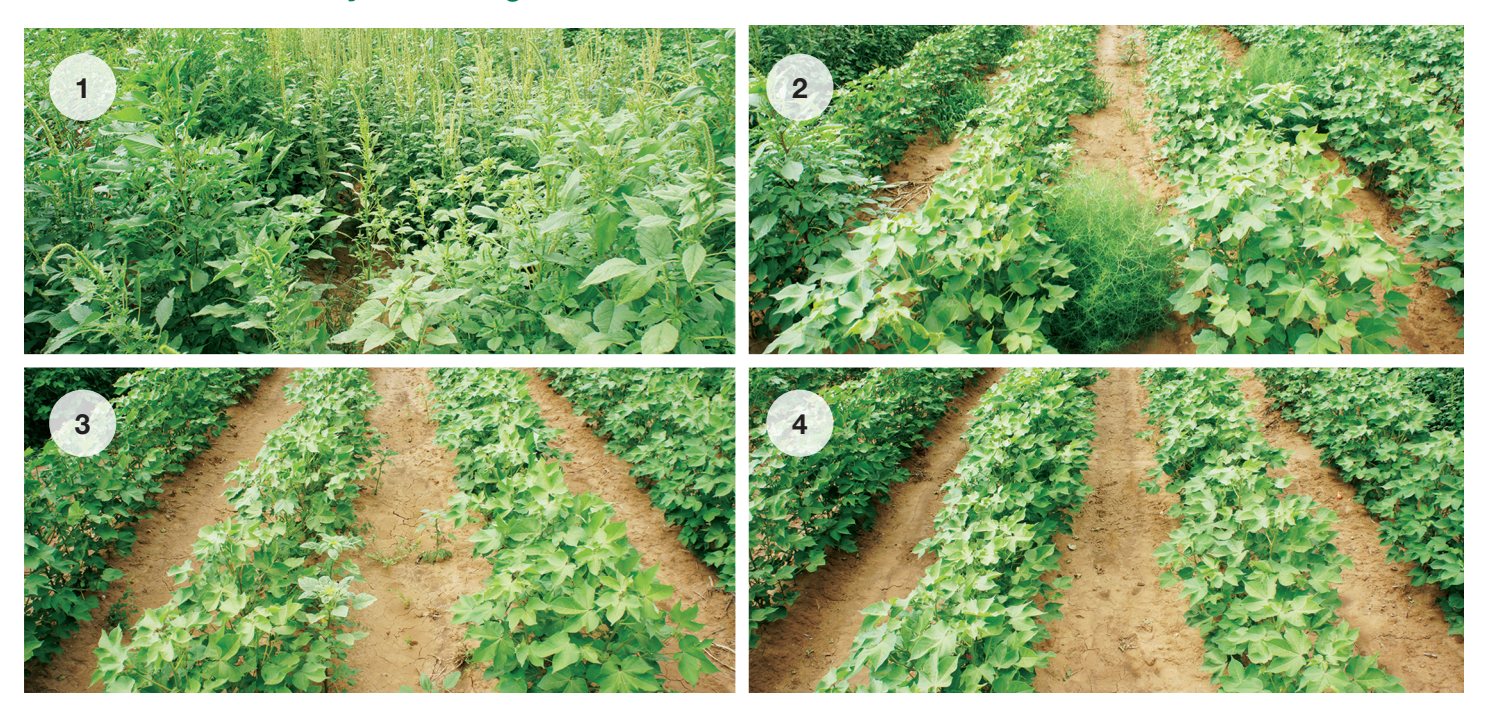
1. Untreated Check. 2. PRE Glyphosate followed by EPOST Glyphosate plus Engenia® herbicide. 3. PRE Prowl® H2O herbicide followed by EPOST Glyphosate Plus Engenia herbicide. 4. PRE Prowl H2O herbicide followed by EPOST Glyphosate plus Engenia herbicide plus Outlook herbicide. BASF sponsored University research trial, Halfway, TX, 2014.