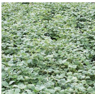
Outlook® herbicide (14 oz.) fb Varisto herbicide (21 oz.) + MSO/UAN

University of Idaho, Kimberly, ID. Photos: 8/5/14 (61 days after PRE treatment, 40 days after POST treatment), Beans planted 6/4/14, Outlook herbicide applied 6/5/14.