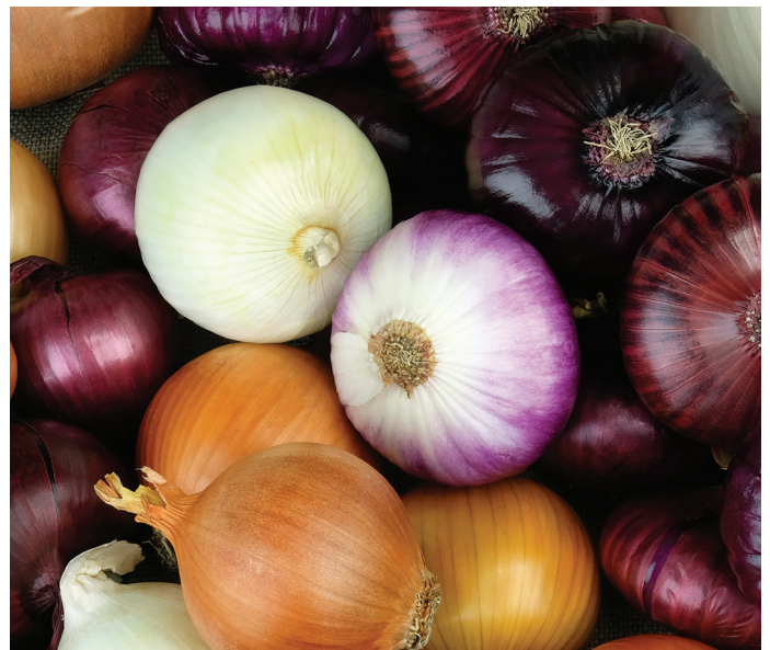
2018 - Onions. BASF Sponsored Trial.