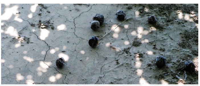
Walnut Blight Wounds Allow for Pathogen Entry