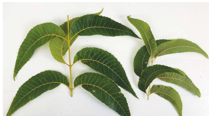
Sefina Insecticide 6 oz/A

2019 Dr. A Acebes-Doria, U of GA, Tifton GA. Application of Sefina insecticide 6 oz/A with adjuvant on Sep 10, 2019. BASF sponsored test.