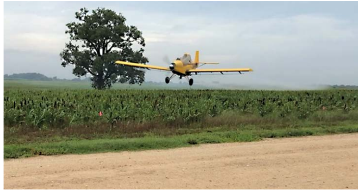
TX AgriLife aerial application trial, 2018. Snook, TX.