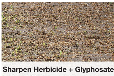
Sharpen Herbicide + Glyphosate

Montana State University Field Trial, 2010. 7 DAT. Sharpen herbicide applied at 1 fl oz/A. Glyphosate applied at 22 fl oz/A. Prickly lettuce burndown application.