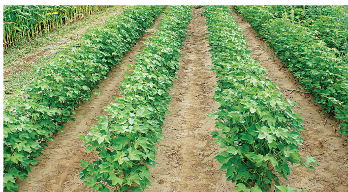
BASF sponsored trial, Texas A&M, Wayne Keeling, Lubbock, TX. Photos taken 42 days after 5 leaf application (7/21/15).