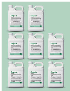
Engenia Herbicide 8 Jugs = 200 Acres