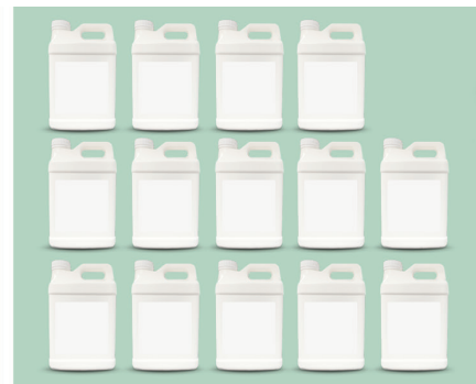
Competitive OTT Dicamba Solution 14 Jugs = 200 Acres