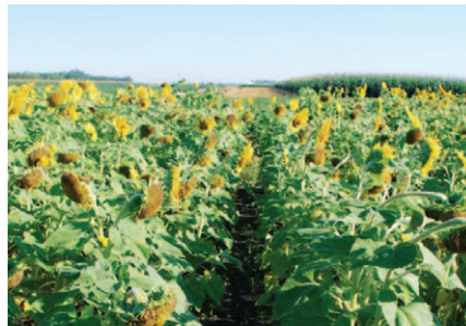
Sulfentrazone PRE (4.5 oz/A)

BASF Field Trial (2010). NDSU, Fargo, ND.