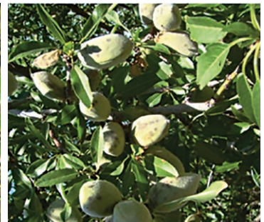
Pristine® fungicide 12 oz

2013 Ag. Advisors Live Oak, CA Applications 1st = PF (3/15/13), 2nd = PF + 5 wks (4/19/13) and 3rd = PF + 8 wks (5/10/13). Photos 74 days after 3rd spray (7/23/13). Trial sponsored by BASF.