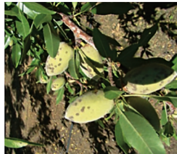
Luna Sensation 5 oz