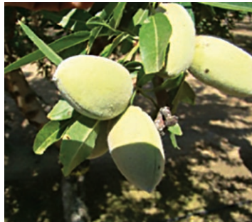
Merivon fungicide 5 oz