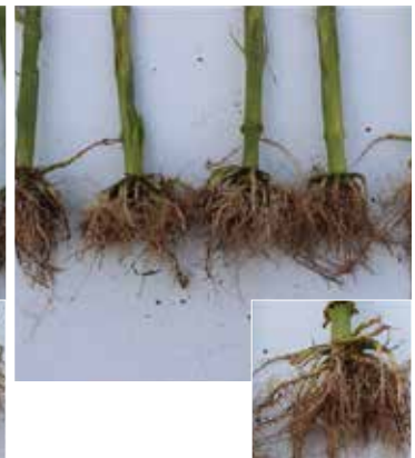
2023 BASF Sponsored Trial. Midwest research trial. C61N. York, NE